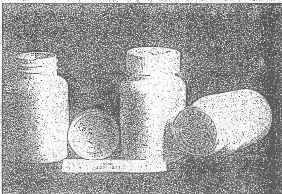
38mm SAF-CAP III-A CLOSURE ON A 150cc HDPE ROUND BOTTLE Figure 1